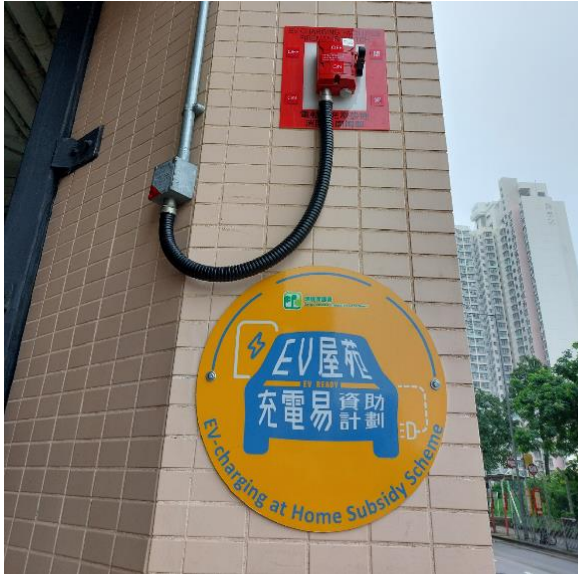
Good installation / workmanship