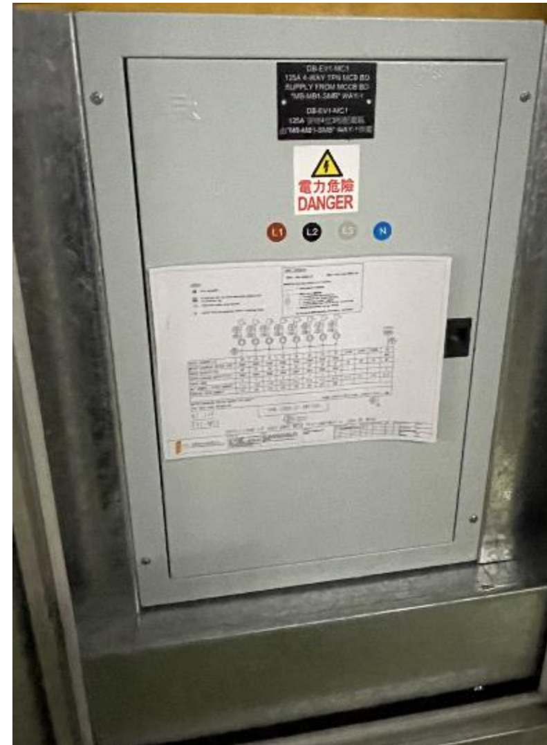
Good installation / workmanship