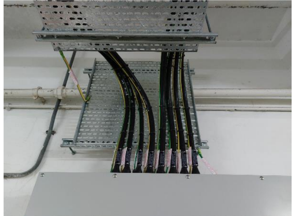
Good installation / workmanship