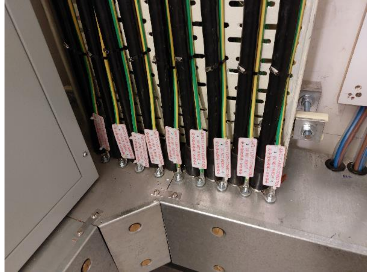
Good installation / workmanship