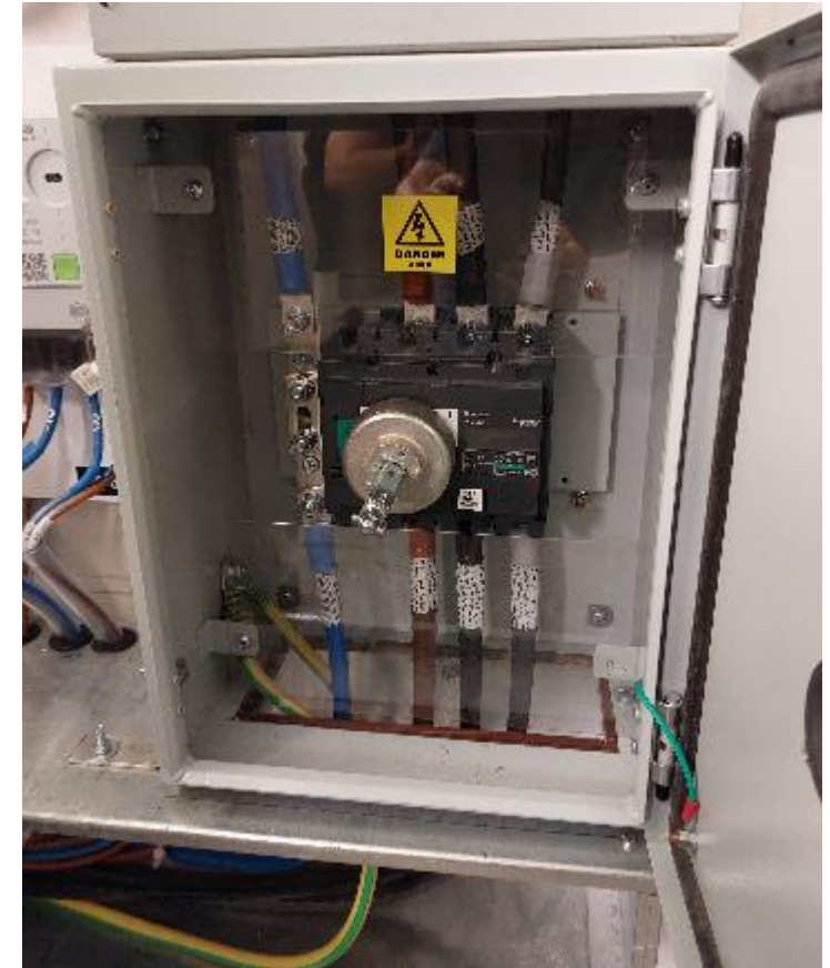
Good installation / workmanship