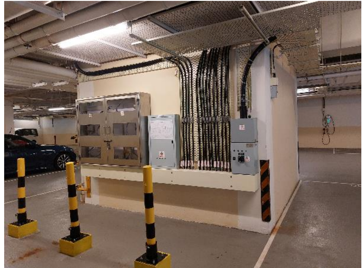
Good installation / workmanship