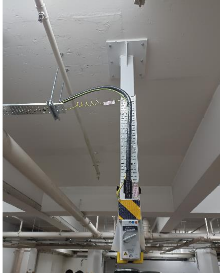
Good installation / workmanship